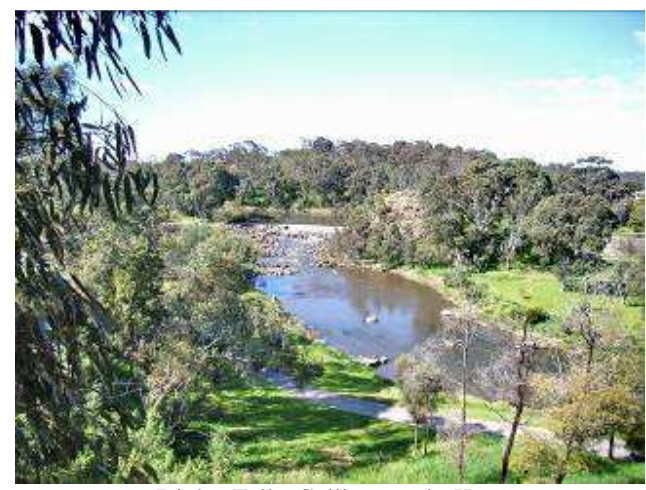
Dights Falls, Collingwood - Kew

The river corridor is renowned for its natural beauty. It is one of the region's prime wildlife habitats and provides city dwellers with first-class opportunities to connect with the natural world; connections which are vital to our physical and mental well-being.