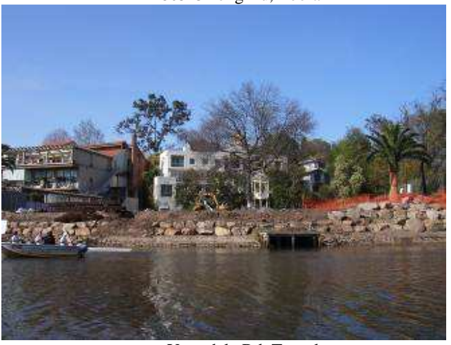
Yarradale Rd, Toorak