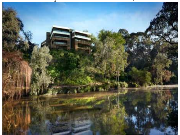
Approved for 9-23 Rex Ave, Alphington