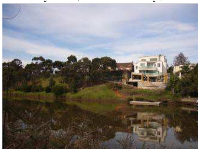
Yarradale Rd, Toorak