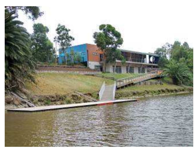
New building/boatshed, Melbourne Girls College, Richmond