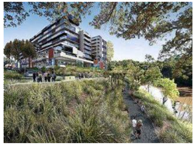
Approved for Flockhart St, Abbotsford