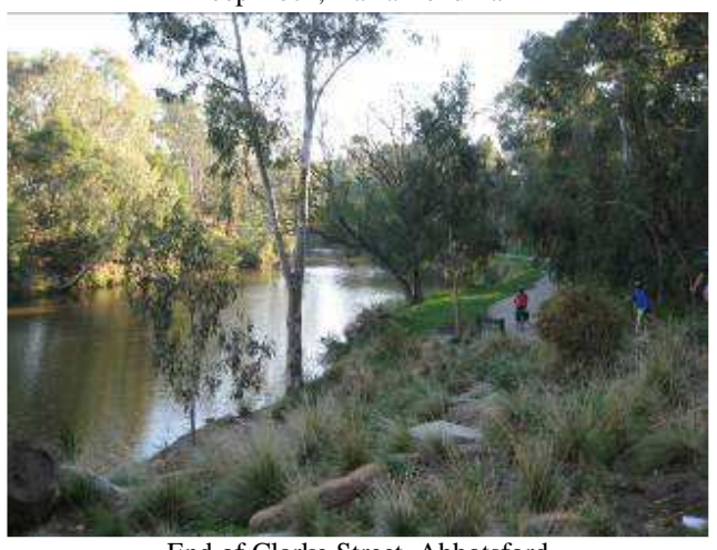
End of Clarke Street, Abbotsford