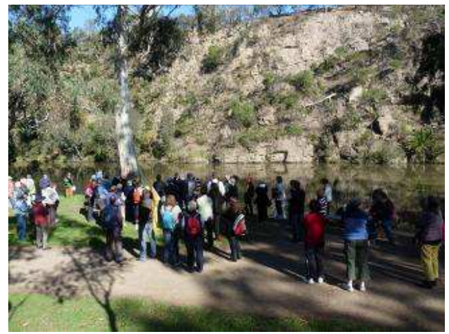
Deep Rock, Yarra Bend Park