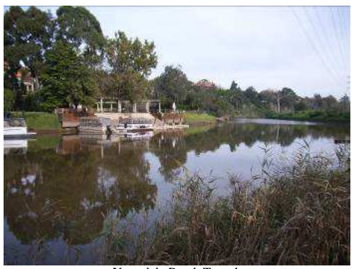
Yarradale Road, Toorak