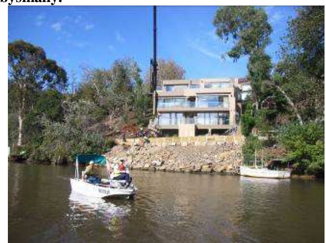
805 Orrong Rd, Toorak

The government's land-use planning system is failing abysmally.