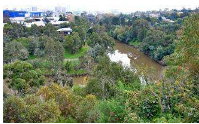
"Eden" development site, Abbotsford