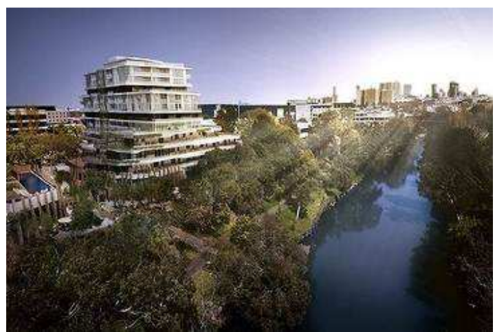
"Eden" development under construction, Abbotsford