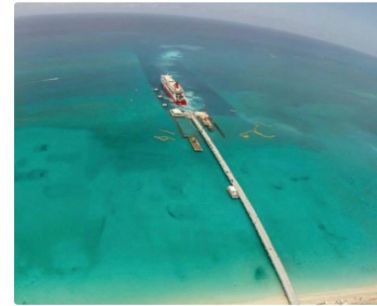
Halt Unregulated Development

We offer adult and student educational programs that teach the necessary delicate balance and relationship of us to our unique Bahamian ecosystems, and how together we thrive and are protected by its bounty.