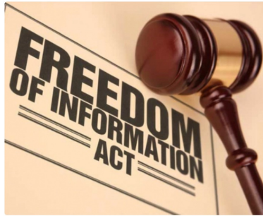
Pass Freedom of Information Act (FOIA)

We assemble teams of staff and volunteers to collect data while patrolling Bahamian lands and waters. The data is monitored to detect changes in conditions and denote problem areas or threats.