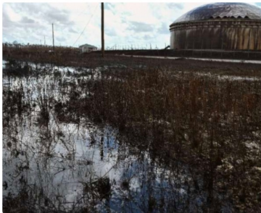
Mitigate Oil Pollution