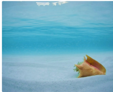
Provide Land and Marine Parks