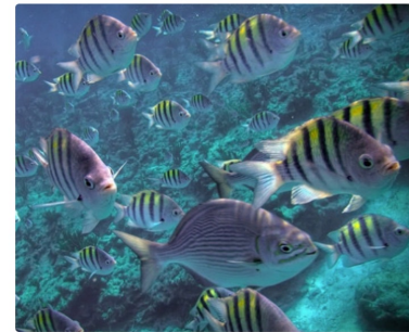
Promote Sustainable Fishing