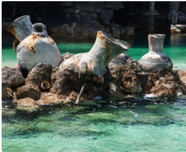
Pass Environmental Protection Legislation (EPA)

We provide evidence of threats or mismanagement of our natural resources to the legal community, encouraging the passage of new laws to stop the depletion of our natural environment.