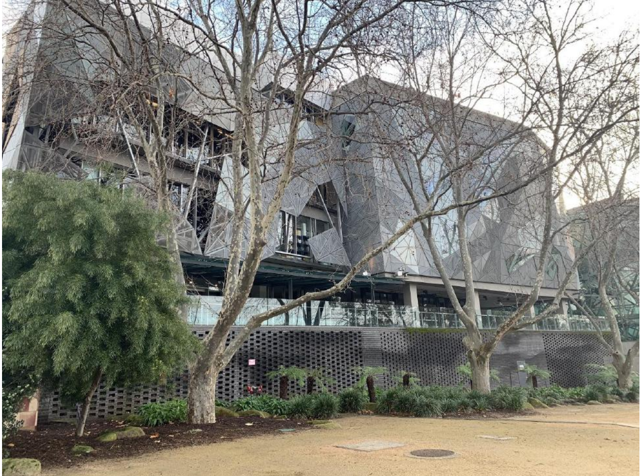
Figure 1: The buildings present as a wall to the river bank.

These annotated photographs make further observations from a river perspective